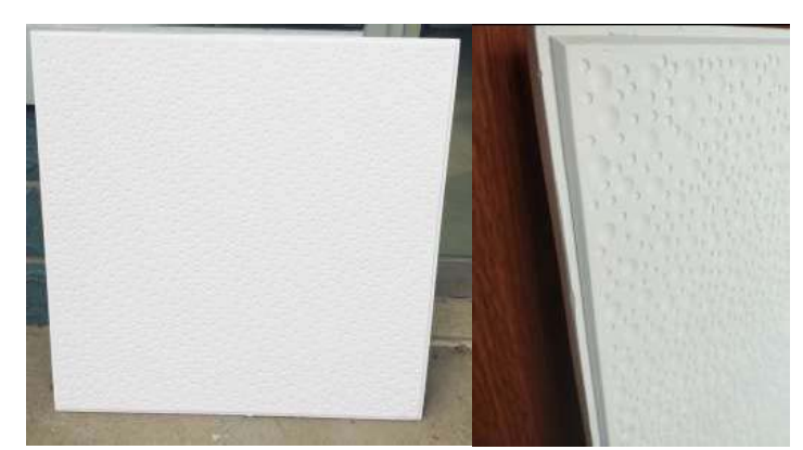
Slate Polka – circular perfed in dual diameters